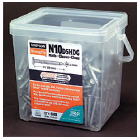
5 lb. Plastic Retail Tub

The Simpson Strong-Tie Hot-Dipped Galvanized nails are now packed in 1 lb. and 5 lb. plastic tubs for easy handling.