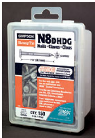
1 lb. Clamshell Retail Tub